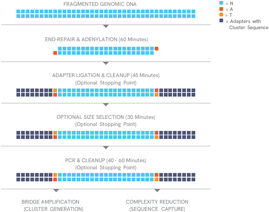
Figure 1: Sample flow chart with approximate times necessary for each step.